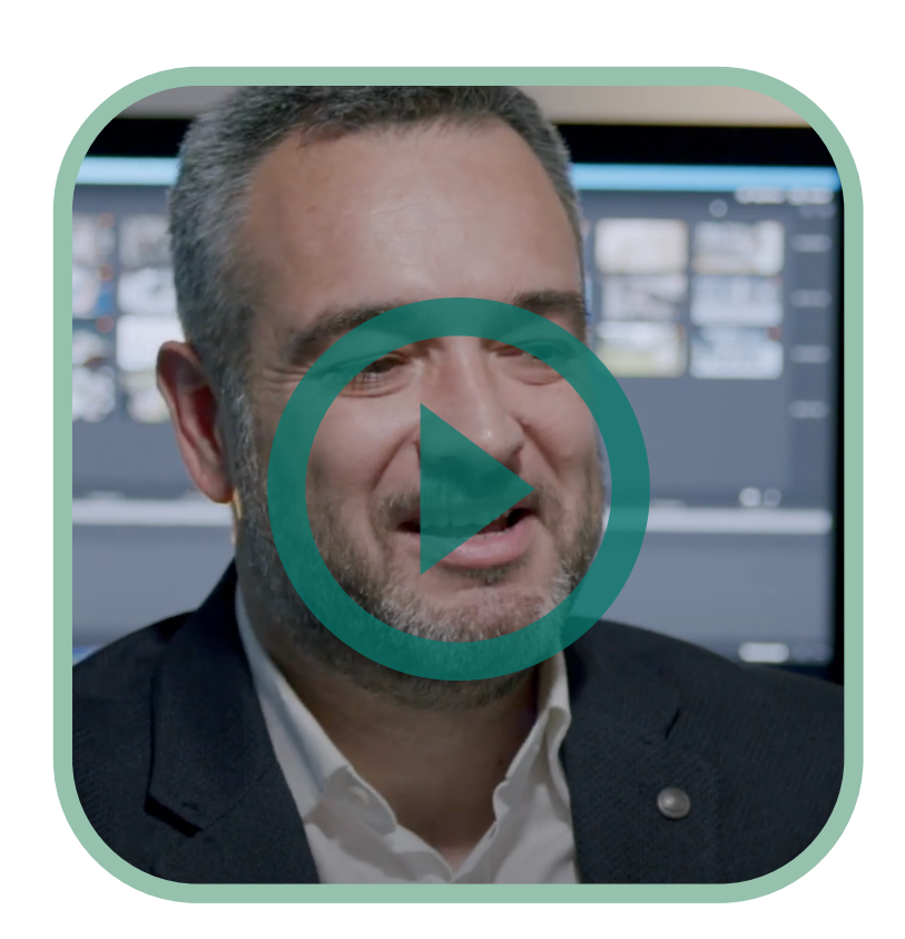
Main concept of the documentary serie QUIM TORRENTS