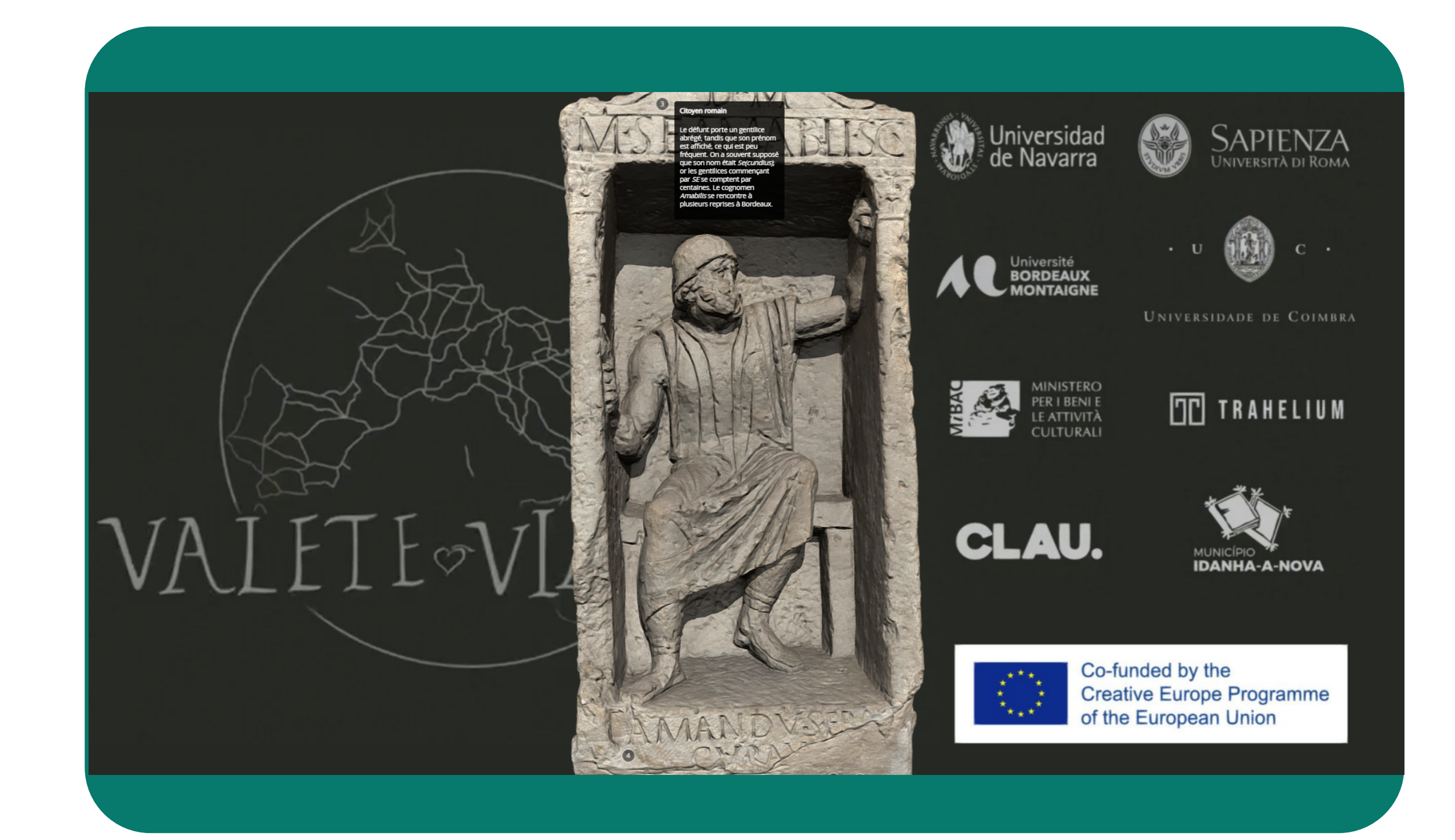
Virtual model of a Roman inscription at the Musée d'Aquitaine, Bordeaux, by Pablo Serrano Basterra