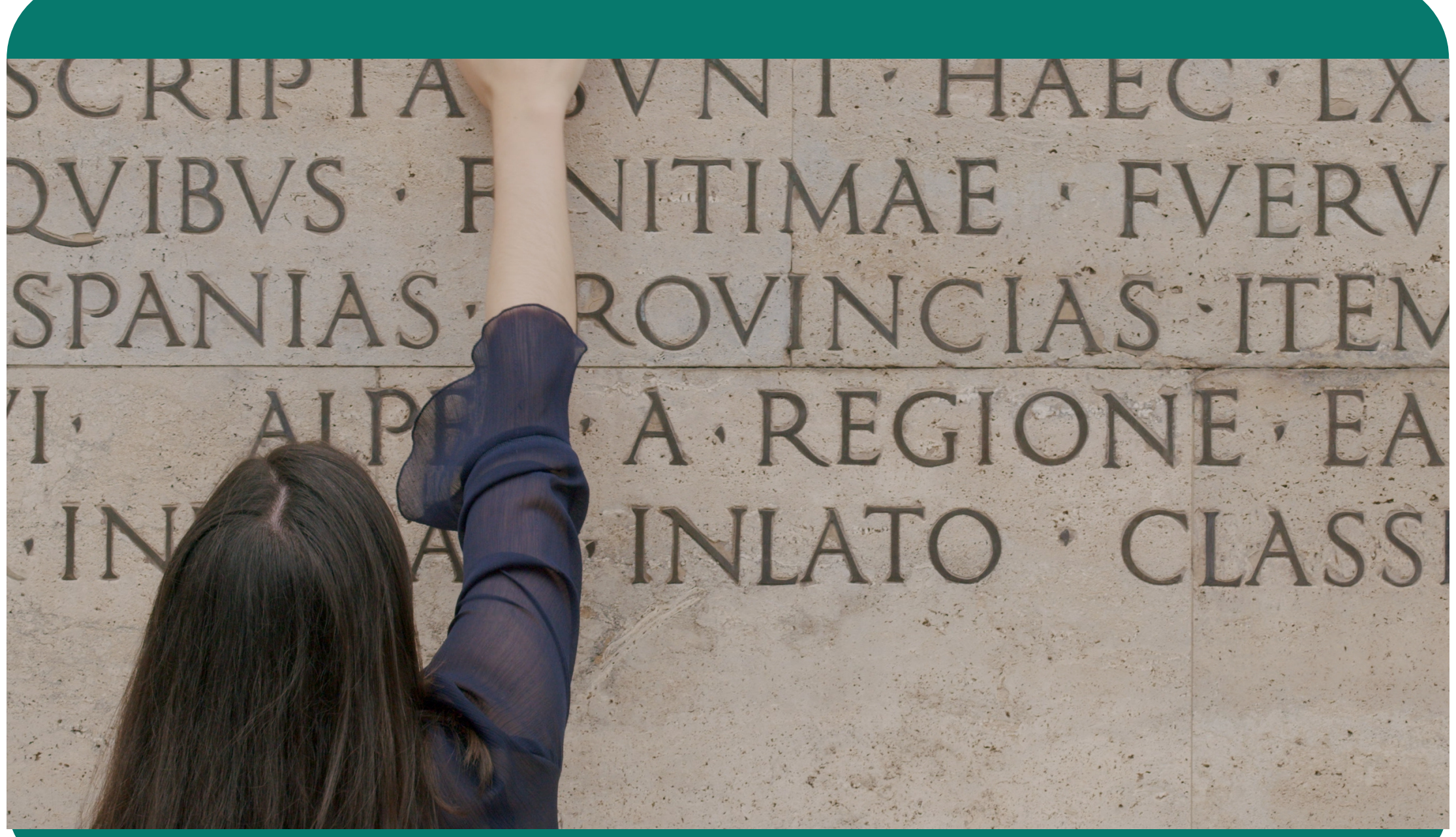
Frame of the project documentary, by Clau Creative